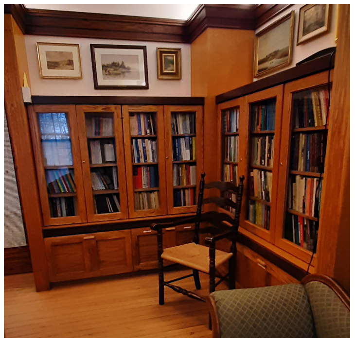
The Alan Wilson Reading Room

In an earlier TUARP Times, I wrote about the Alan Wilson Reading Room at Kerr House, Trill College, the home of Canadian Studies. It is an exquisitely crafted and furnished tribute to a key contributor to Trent.